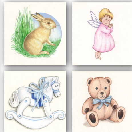
A selection of possible bespoke illustrations