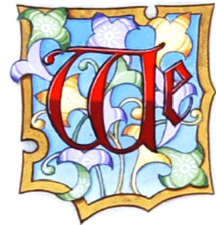
Hand Painted Artwork Detail