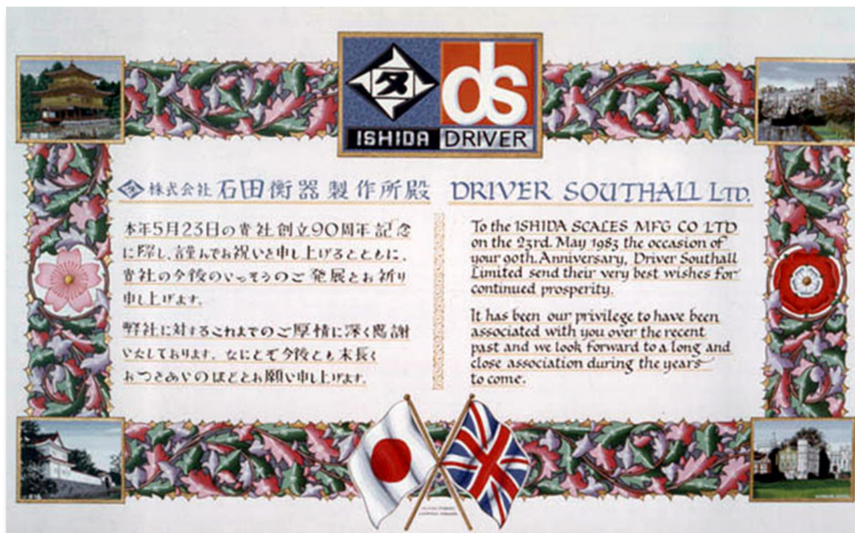
Business Association Framed Piece