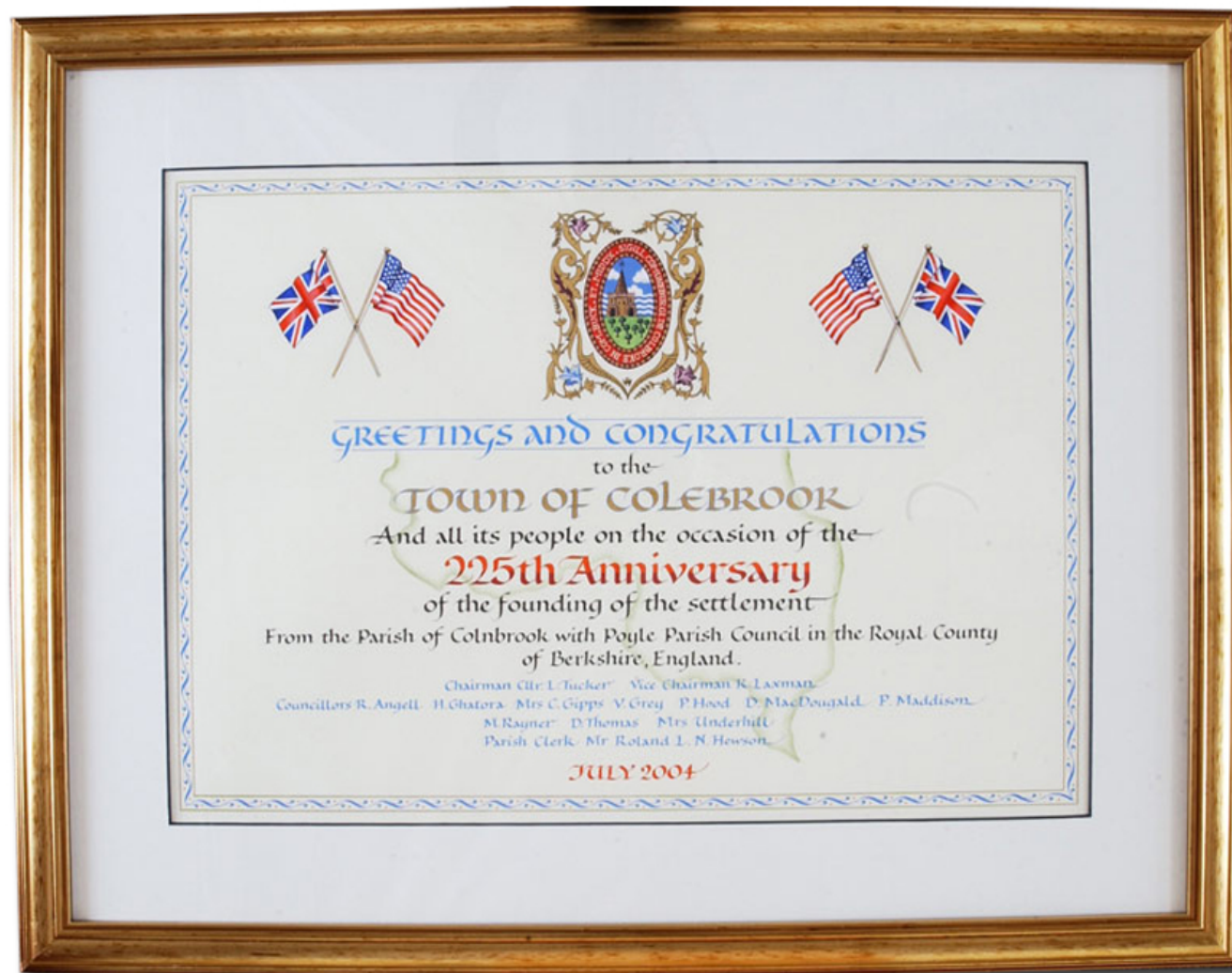
Town Anniversary Framed Piece