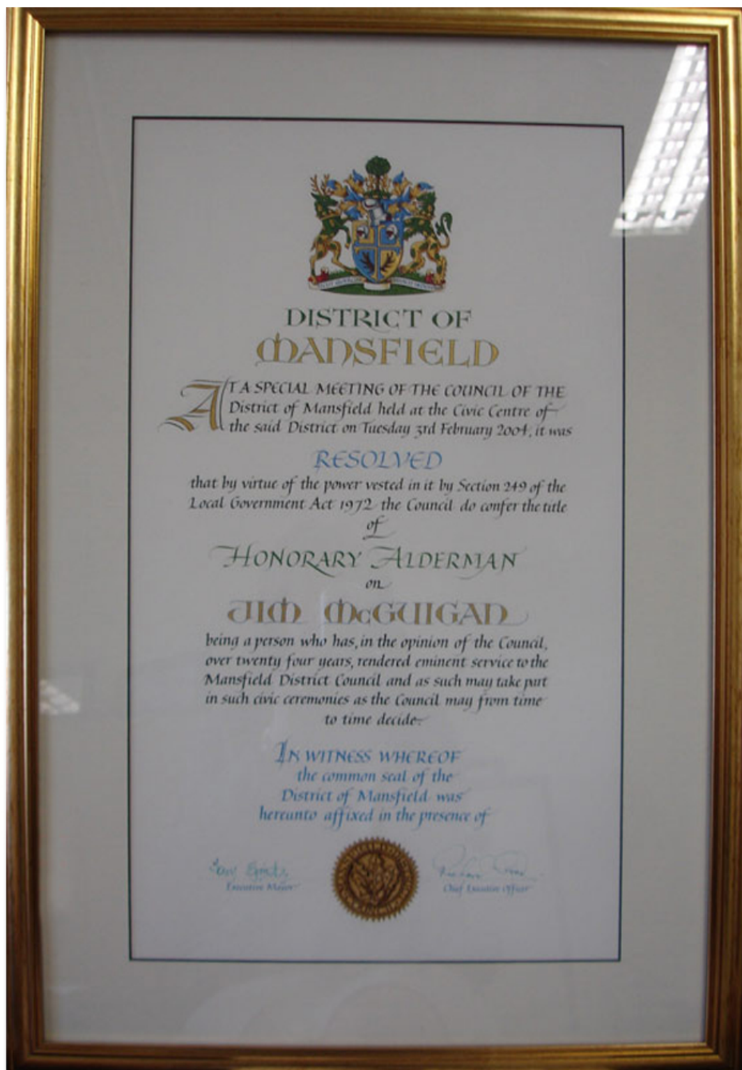
Honorary Alderman Framed Piece