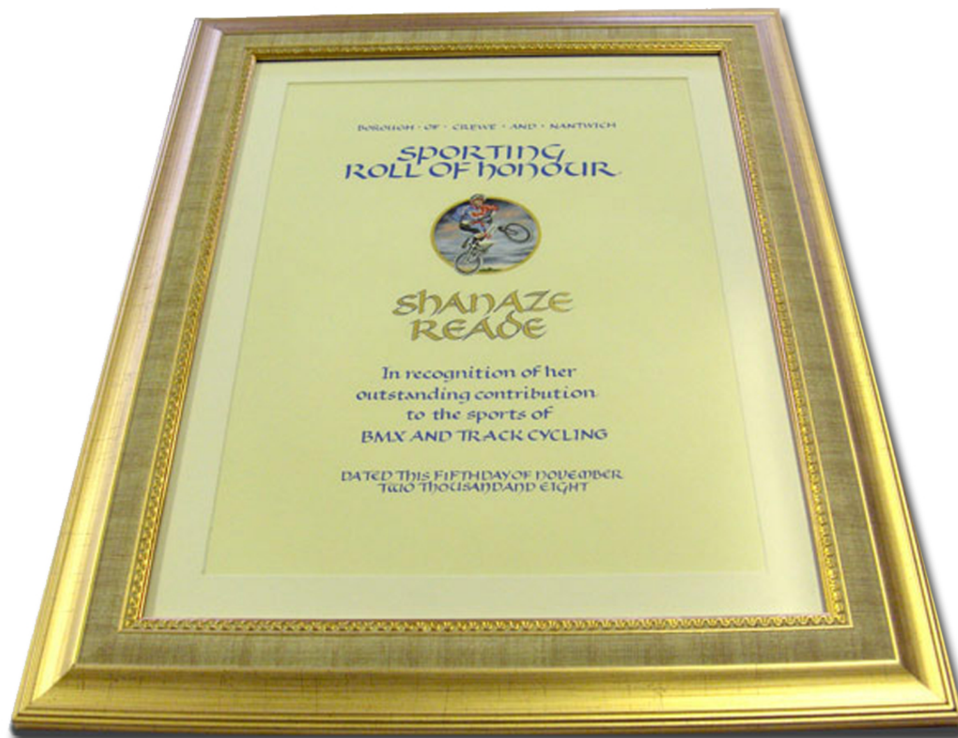
Shanaze Reade Sporting Honour Framed Piece