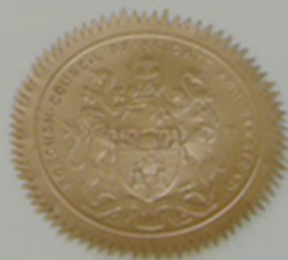
Reigate & Banstead Alderman Framed Piece