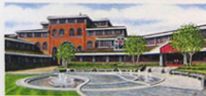
Freedom Framed Piece